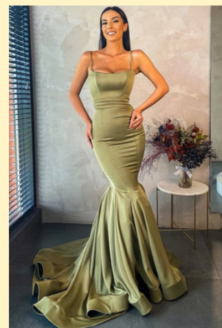
Very tight- fitting, gives an immodest look