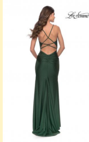
Very low back