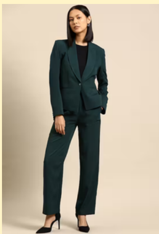
Formal jumpsuits and suits are great options, as well.