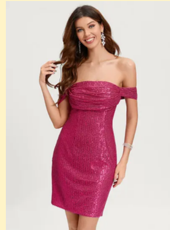
Too short, immodest neckline