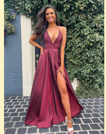
High slit, deep neckline, very long