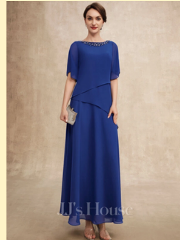
More of a "Mother of the bride" dress, not prom dress for young girls